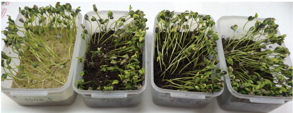
Photo 1. Soybean seedlings after eight days germination in different organic substrates and sand Fotografija 1. Klijanci soje osam dana nakon klijanja u različitim organskim supstratima i pesku

Organic substrates mixed with sand in this experiment also formed excellent growing media for germination of soybean seed. Peat was very light and easy for use, with very high water holding capacity and also very well aerated. That is very important in the case of seed lots with lower quality. Seedlings were well developed and slightly bigger than those germinated in the sand (Photo 1). Johnston (2013) report-